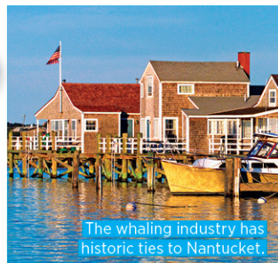
The whaling industry has historic ties to Nantucket.