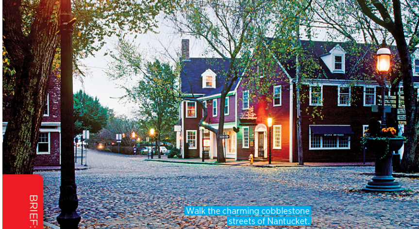
Walk the charming cobblestone streets of Nantucket.